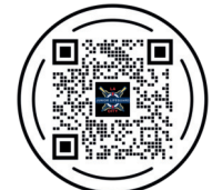
Junior Lifeguard Homepage

Online at recreation.parks.lacity.gov & In-Person for Summer 2026