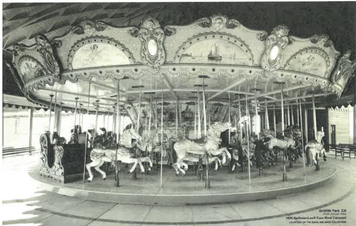
Griffith Park, CA 1926 Spillman, Looff Four-Row Carousel