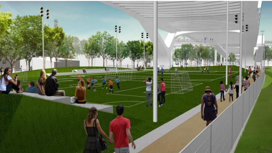
SYNTHETIC SOCCER FIELD